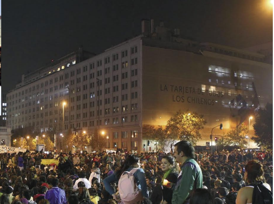
Protests against big Hydropower projects are a key driver of civil protests in Chile