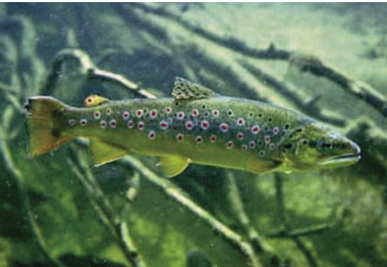
Brown trout.

Moreover, water is, beyond its immediate use, seen by humans as a symbol of life. This is reflected in the arts and cultures of civilisations around the globe. The livelier these traditions are, the more the values of water are stressed. It is essential to reclaim the social and cultural value of water and defend it against a purely technocratic and means-to-an-end oriented view.